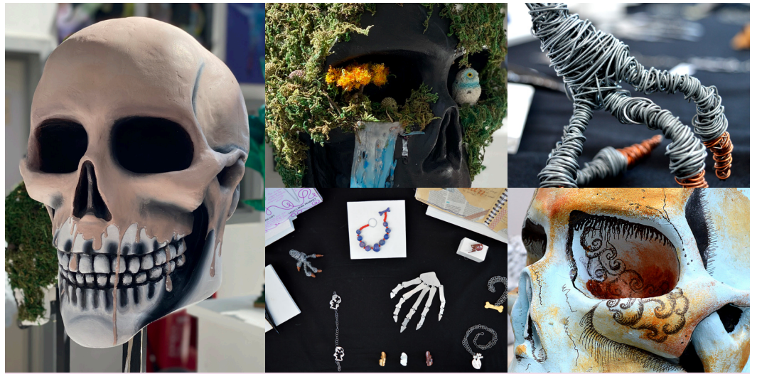
Level 3 Art & Design students showcased the Skin & Bones Exhibition.